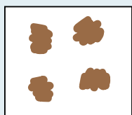
All in the family

Check the color of a mole. Is the color the same throughout the mole, or does it vary with shades of dark brown to black, or shades of white, red or blue? If there are any color changes from one area of a mole to another, see your doctor.